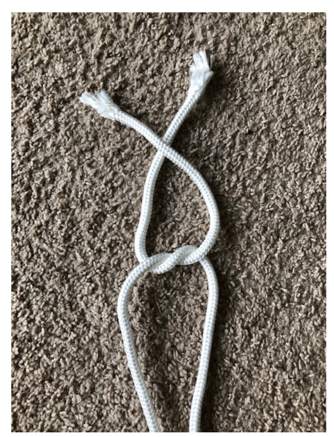
Step 4: Take the top bits of rope and place the top that is on the right, over the top that is on the left.