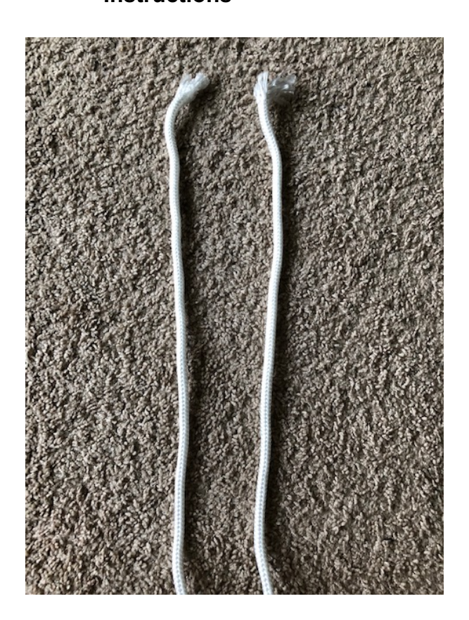
Step 1: Take your two pieces of rope and hold or lay them side-by-side.