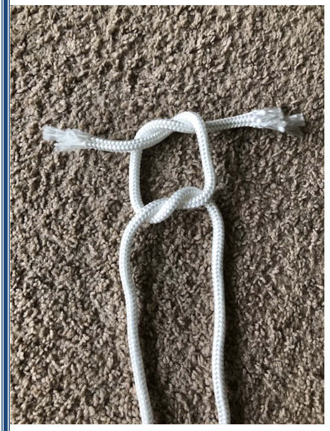
Step 5: Tuck the rope from the right underneath the rope on the left.