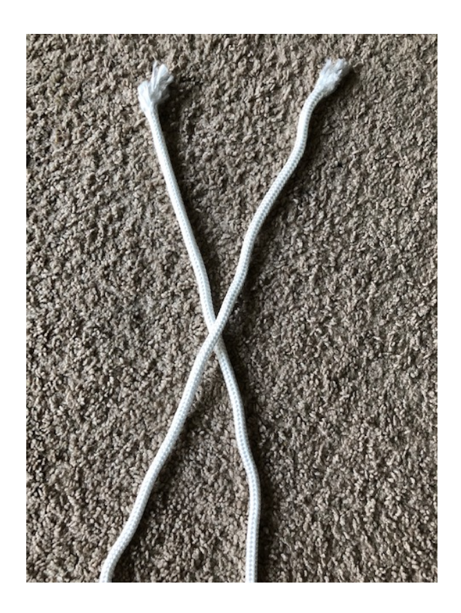
Step 2: You will then take the rope on the left, place it over the rope on the right.