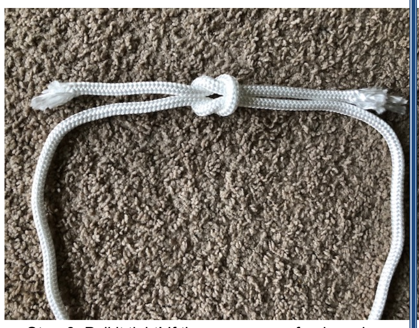
Step 6: Pull it tight! If the ropes move freely and looks like a figure eight (8) then you know you've done it right!